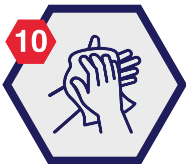
Dry hands thoroughly with a single use towel