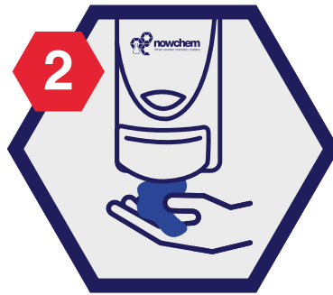
Apply enough soap to cover all hand surfaces