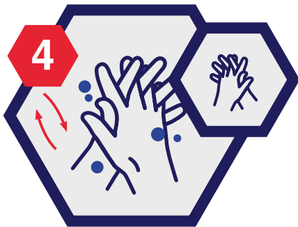
Right palm over left dorsum with interlaced fingers and vice versa