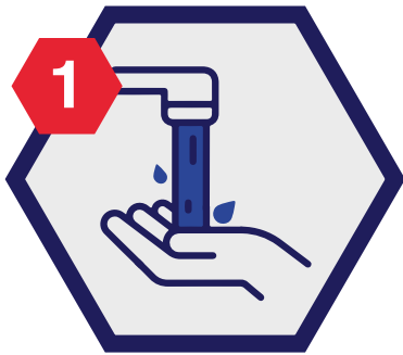
Wet hands with water