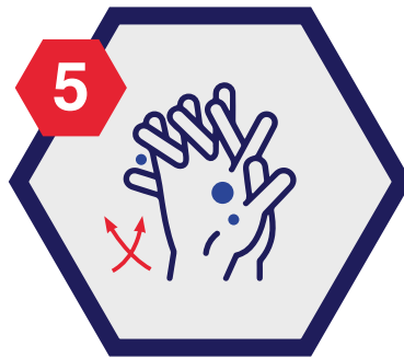
Palm to palm with fingers interlaced