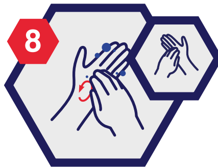
Rotational rubbing, backwards and forwards with clasped fingers of right hand in left palm and vice versa