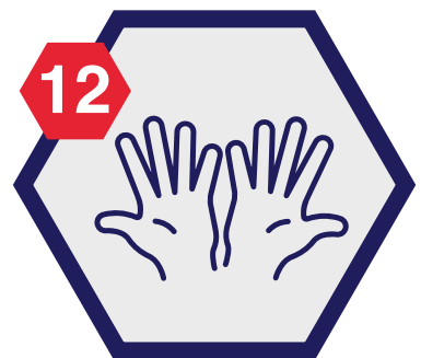
Your hands are now safe