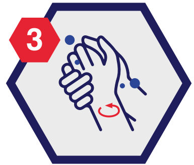
Rub hands palm to palm