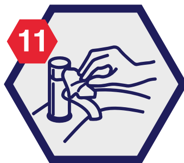
Use towel to turn off faucet