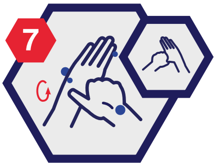
Rotational rubbing of left thumb clasped in right palm and vice versa