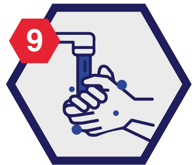
Rinse hands with water