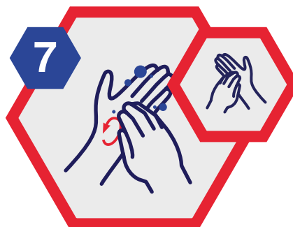
Rotational rubbing, backwards and forwards with clasped fingers of right hand in left palm and vice versa