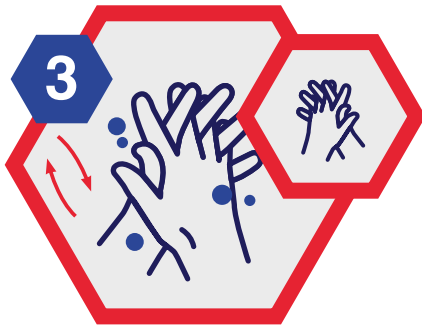
Right palm over left dorsum with interlaced fingers and vice versa