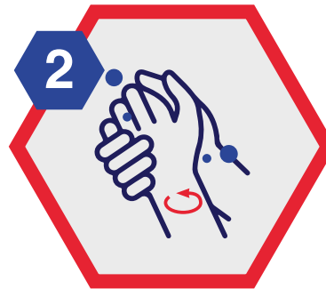
Rub hands palm to palm