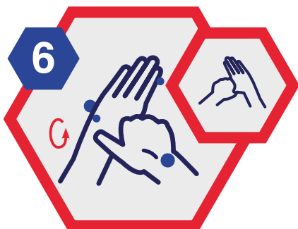
Rotational rubbing of left thumb clasped in right palm and vice versa