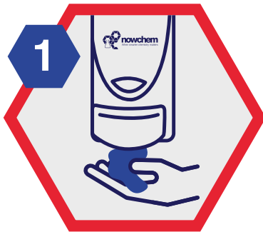
Apply Sanitiser to all surfaces of a cupped hand