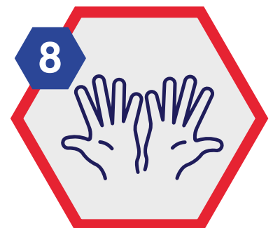
Once dry, your hands are safe